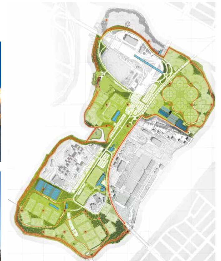
North-east fields. North-west comfort station. South-east side of the park. Icahn Stadium. Sportime/John McEnroe Tennis Academy. Master plan. South-west fields. Icahn Stadium.