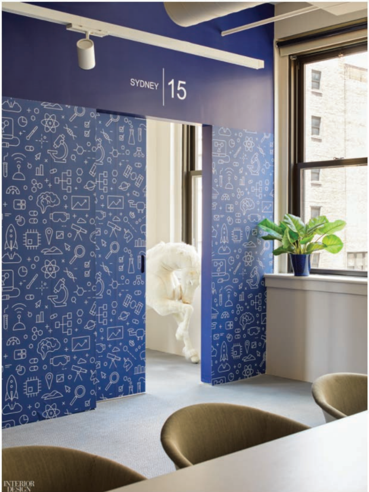
The carpets and panels create optimal acoustics for both open and closed spaces.