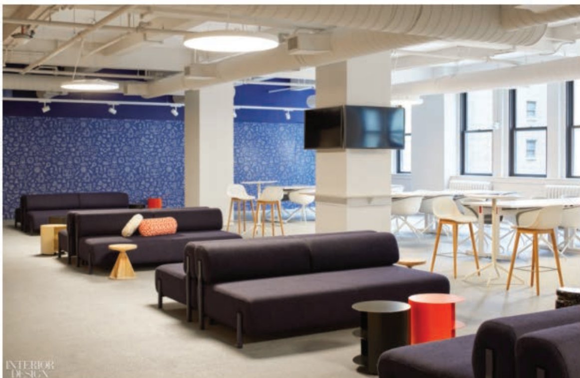
Casual furniture and booths for single occupancy are placed in the work spaces creating separation between zones.

Born out of necessity as well as intent, with a streamlined budget, the aesthetics of the new CBI HQ were more strategic rather than extravagant. Moving away from typical commercial interiors, RZAPS kept the mechanical ducts, pipes, and data raceways systems exposed as well as the terrazzo flooring unearthed during demolition, all working together to yield an industrial, energetic character—just like CBI itself.