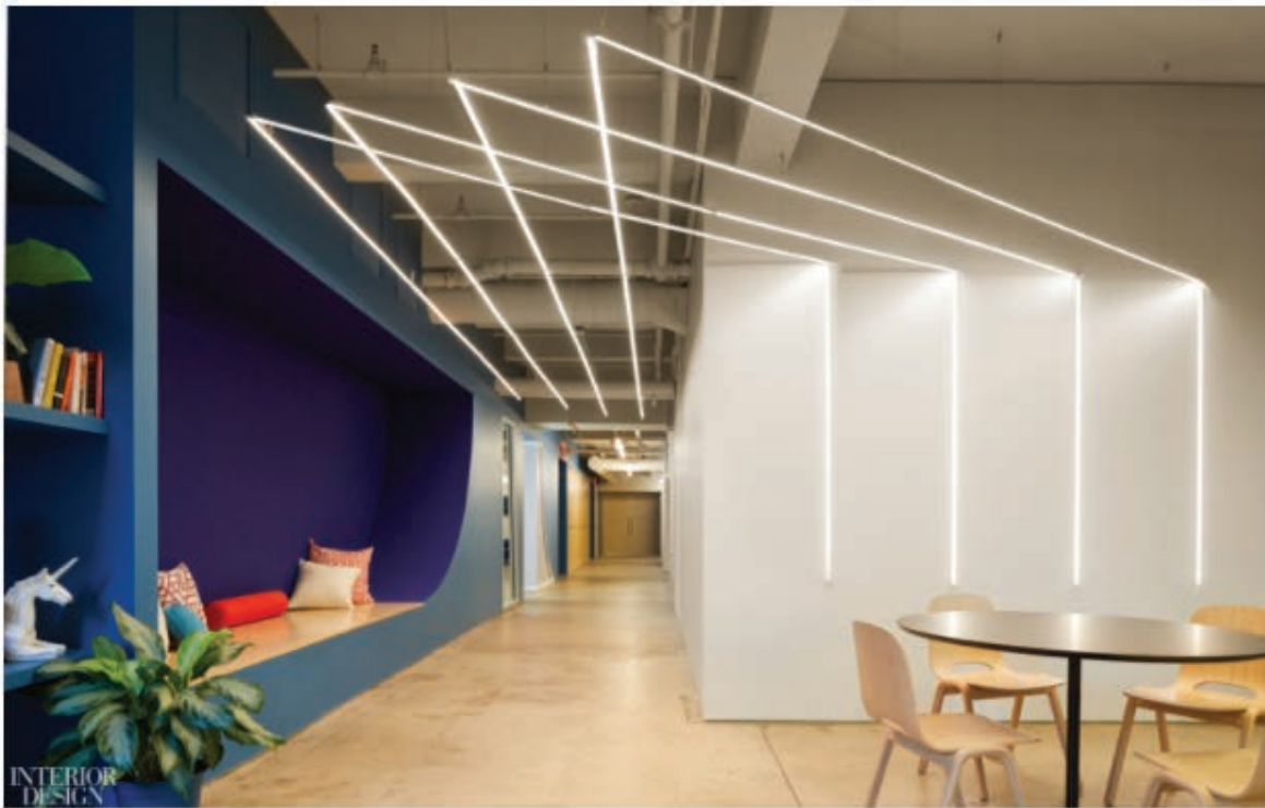
Angular neon lights continue from the cafeteria into Main Street.

Born out of necessity as well as intent, with a streamlined budget, the aesthetics of the new CBI HQ were more strategic rather than extravagant. Moving away from typical commercial interiors, RZAPS kept the mechanical ducts, pipes, and data raceways systems exposed as well as the terrazzo flooring unearthed during demolition, all working together to yield an industrial, energetic character—just like CBI itself.